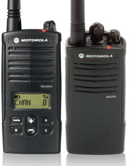
RDM OR RDX SERIES™

TRADE-IN GET $210 OR CASH REBATE GFT $150 Up to 16 Channels, 2W to 5W