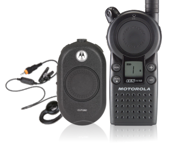
CLP™ OR CLS SERIES™

TRADE-IN GET $180 OR CASH REBATE GET $120