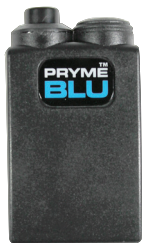
Bluetooth Adapter Model No.: BT-501-DIRECT Made in Taiwan

The PRYMEBLU Adapter allows you to use a compatible wireless headset or other audio accessory with your 2-way radio.